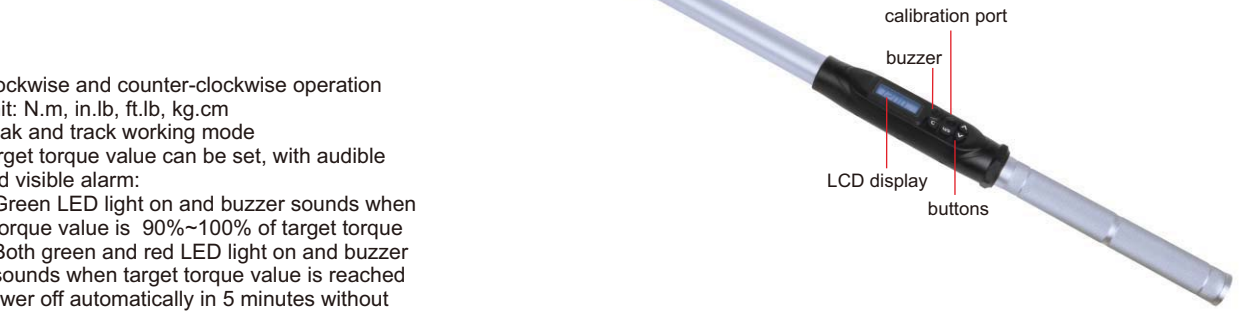
IST-W1200A type B